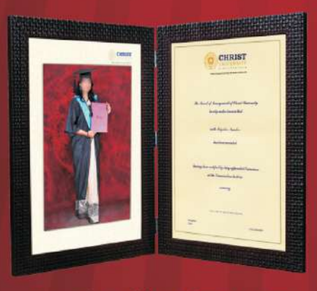
Hinged & Folding Photo Frame One 8"X12" Print with frame